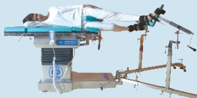
Femur treatment in lateral position, using Countertraction Post for Femur