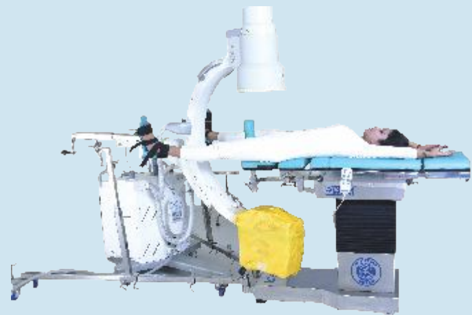
Neck of the femur treatment (DHS)