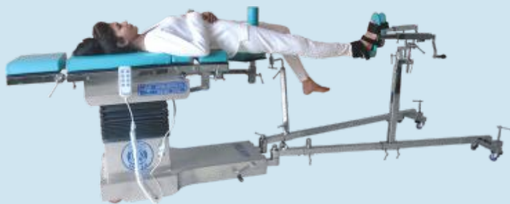
Femur treatment in supine position