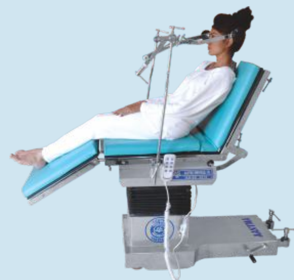
Sitting Position Neuro Surgery