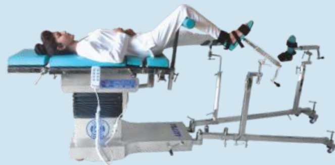
Tibia and Fibula