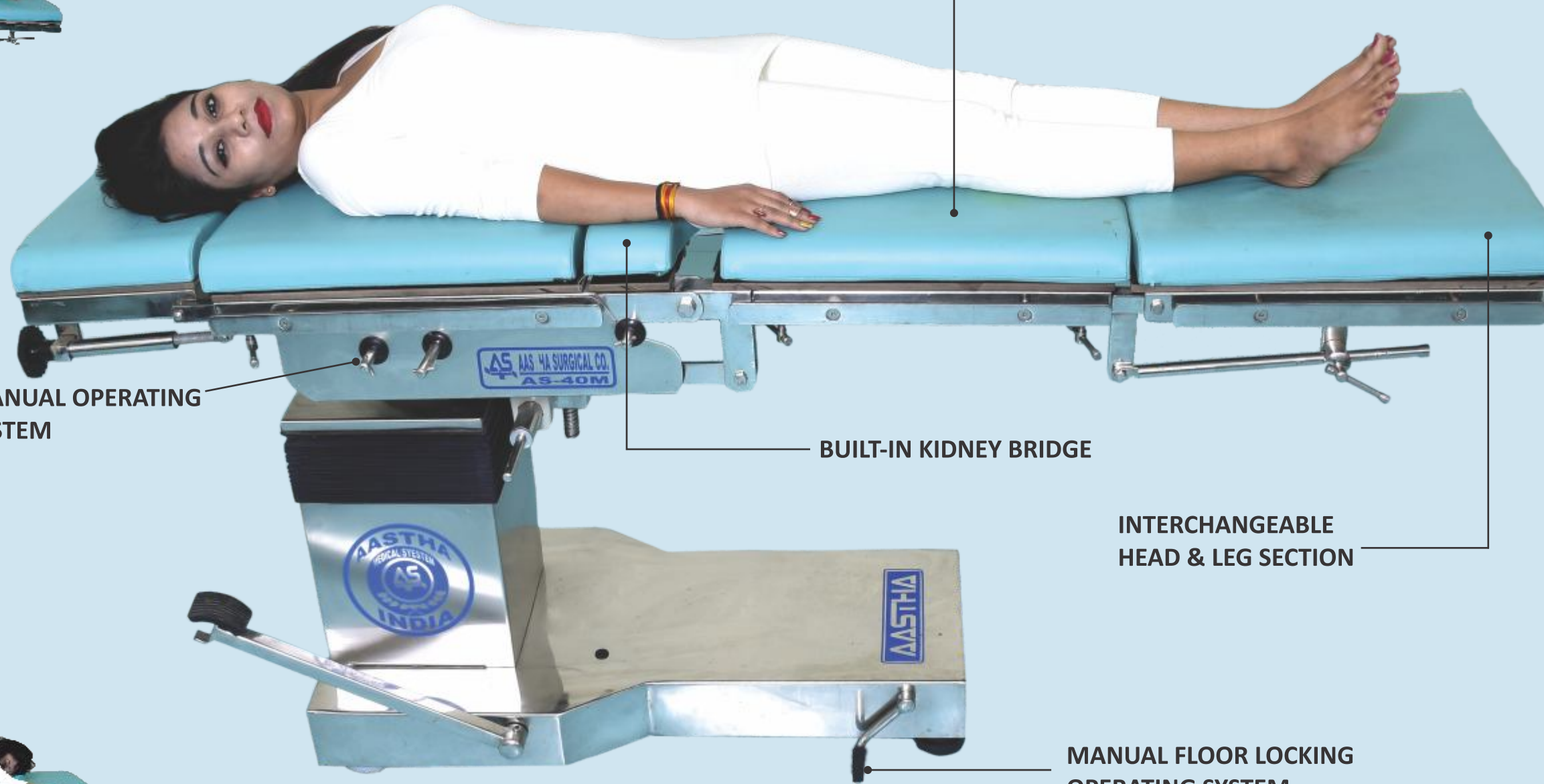
MANUAL OPERATING SYSTEM