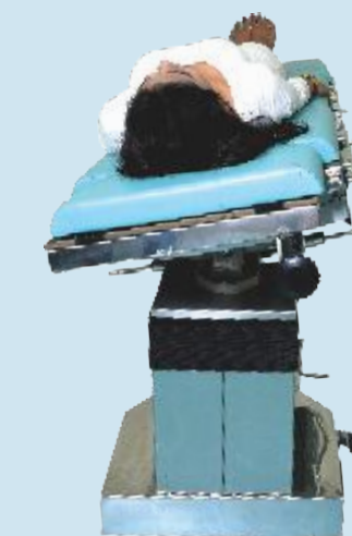
Lateral Tilt - Left