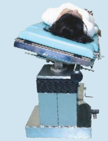
Lateral Tilt - Right