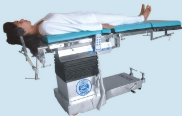
Three Pin Head Neuro Attachment