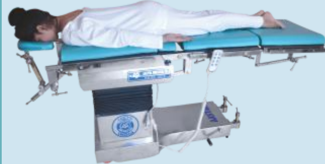
Horse Shoe Head Rest